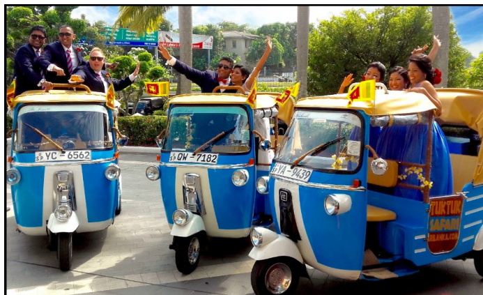
Photo above added by Editor to show tuk tuks

Overall, the vehicles here are fairly new, and a mix of European and Asian makes: BMW, Volvo, Audi, Toyota, Honda, and Kia. Not many US. And tuk tuks—lots of tuk tuks!