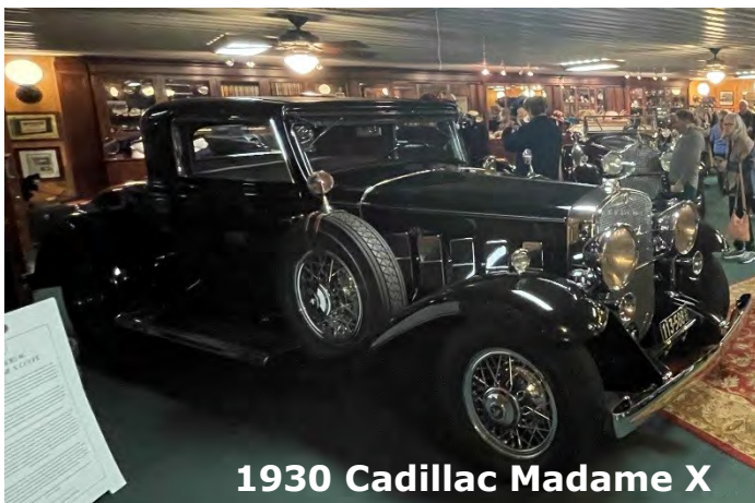
1930 Cadillac Madame X

The Cadillac star of the collection was the 1930 V16 Madame X Coupe below. The name "Madame X" was never used by Cadillac. The name gained popularity in the '30s after a Cadillac was featured in a famous stage play. The Madam X models were particularly characterized by the Fleetwood body style. The majority were V16s.