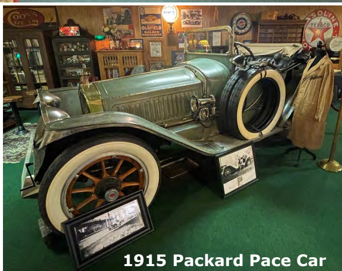
1915 Packard Pace Car

Pictured below the pace car is a real contrast of vehicles; a Packard and a Nash Metropolitan.